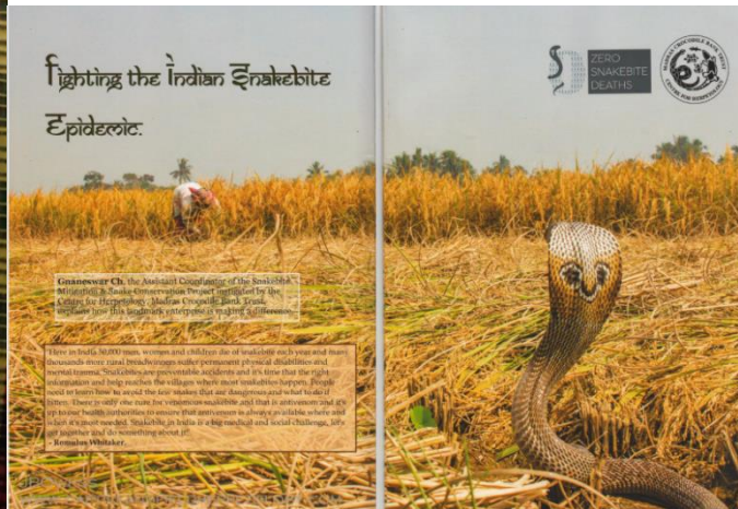
Newspaper and magazine articles