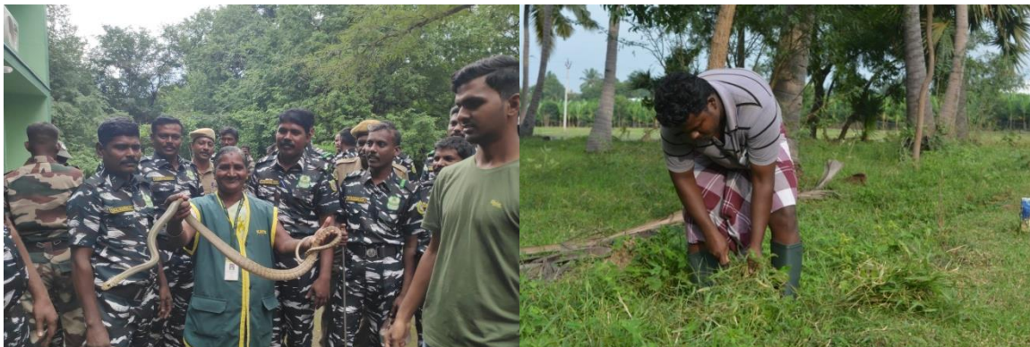
Training workshop for Forest Department