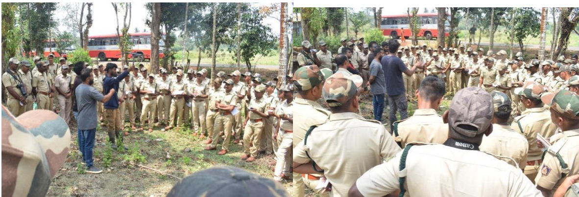
29/02/2020. One of the several visits to ARRS and KCEC field sites by Forest Department recruits...

Over 30 awareness programs were conducted through the year. Additionally, there were interactions with daily visitors at the base, and onsite awareness programs during every rescue call. This continues to make the local community more and more comfortable about having kind cobras and other snakes as neighbours.