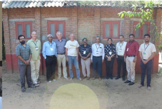
Snakebite experts meeting at MCBT