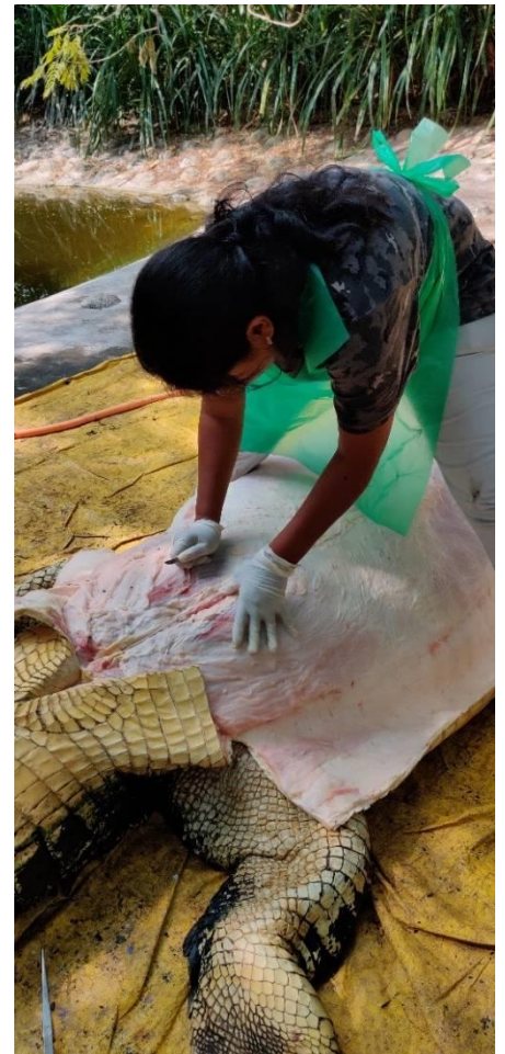
Figure 2: Necropsy of Jaws III