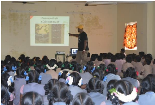
Education program at a school