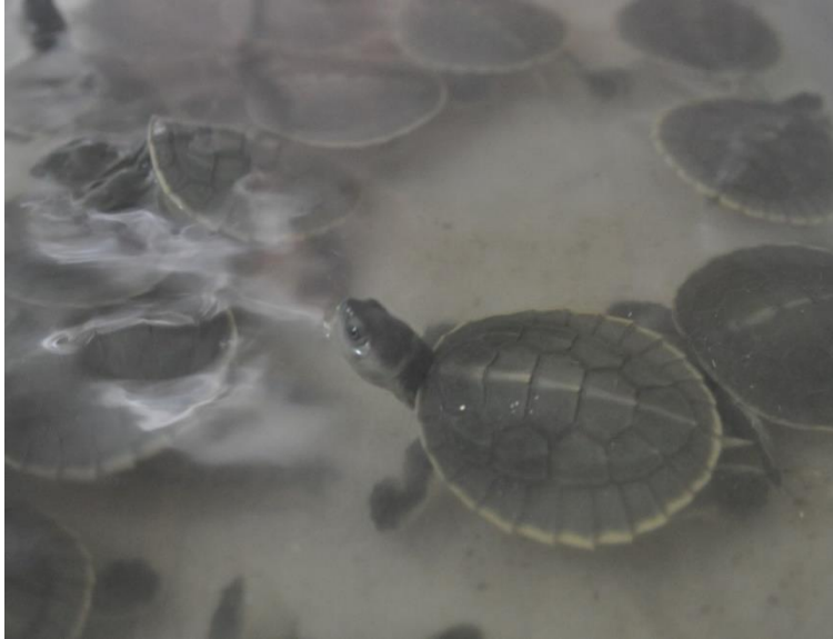
Figure 1 Northern river terrapins from the 2018/19 clutch